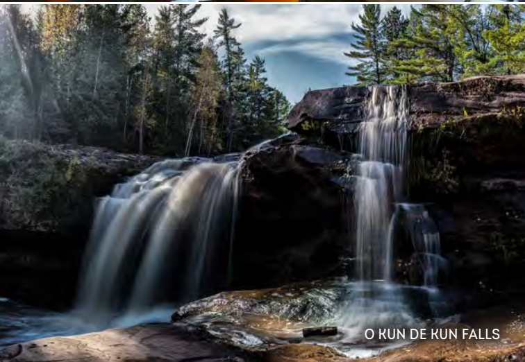
O KUN DE KUN FALLS